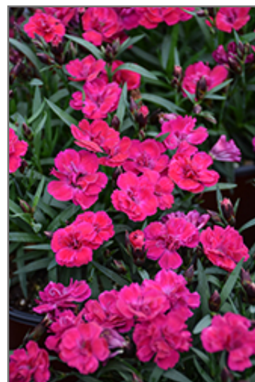
Beauties Tiiu Pinks flowers

Beauties Tiiu Pinks is recommended for the following landscape applications;