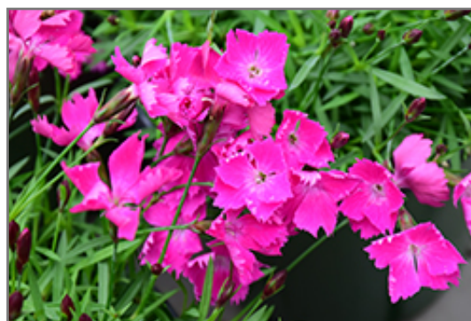
Beauties Kahori Pinks flowers