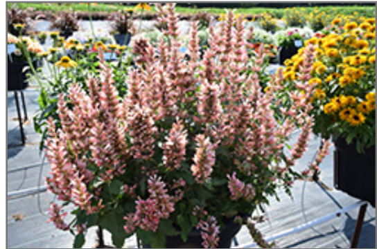
Pink Pearl Hyssop in bloom

Pink Pearl Hyssop will grow to be about 8 inches tall at maturity extending to 16 inches tall with the flowers, with a spread of 16 inches. Although it's not a true annual, this fast-growing plant can be expected to behave as an annual in our climate if left outdoors over the winter, usually needing replacement the following year. As such, gardeners should take into consideration that it will perform differently than it would in its native habitat.