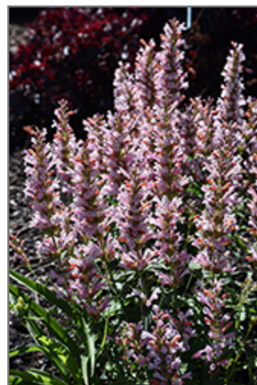
Pink Pearl Hyssop flowers

Pink Pearl Hyssop is recommended for the following landscape applications;