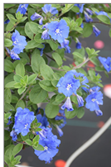
Blue My Mind XL Morning Glory flowers