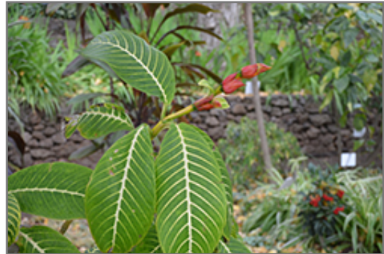
White-veined Sanchezia flowers

White-veined Sanchezia will grow to be about 6 feet tall at maturity, with a spread of 5 feet. Although it's not a true annual, this fast-growing plant can be expected to behave as an annual in our climate if left outdoors over the winter, usually needing replacement the following year. As such, gardeners should take into consideration that it will perform differently than it would in its native habitat.