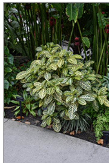
White-veined Sanchezia