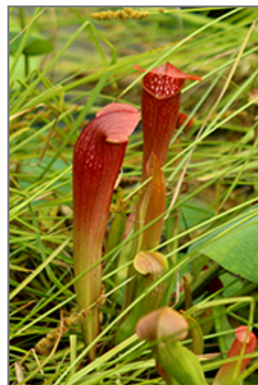
Bug Bat Pitcher Plant