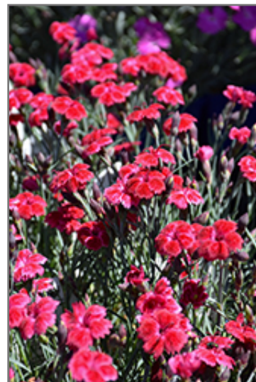
Single Ladies Red Rouge Pinks flowers