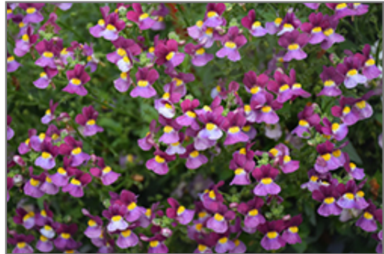
Aromance Mulberry Nemesia flowers

Aromance Mulberry Nemesia is a fine choice for the garden, but it is also a good selection for planting in outdoor containers and hanging baskets. It is often used as a 'filler' in the 'spiller-thriller-filler' container combination, providing a mass of flowers against which the larger thriller plants stand out. Note that when growing plants in outdoor containers and baskets, they may require more frequent waterings than they would in the yard or garden.