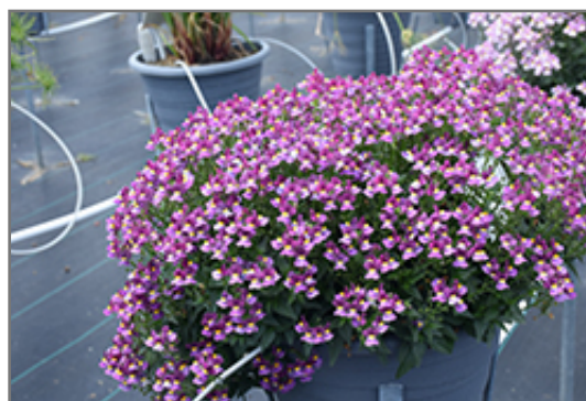
Aromance Mulberry Nemesia in bloom