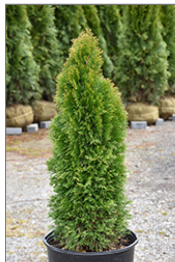
Emerald Petite Arborvitae