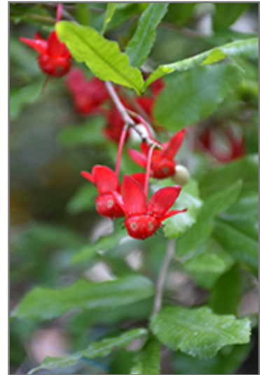
Mickey Mouse Plant flowers

This plant is not reliably hardy in our region, and certain restrictions may apply; contact the store for more information.