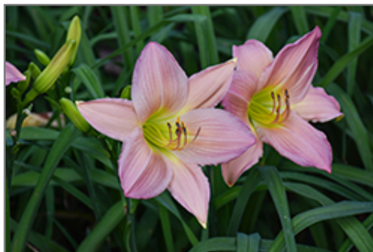
Pink Lavender Appeal Daylily flowers

Pink Lavender Appeal Daylily is recommended for the following landscape applications;