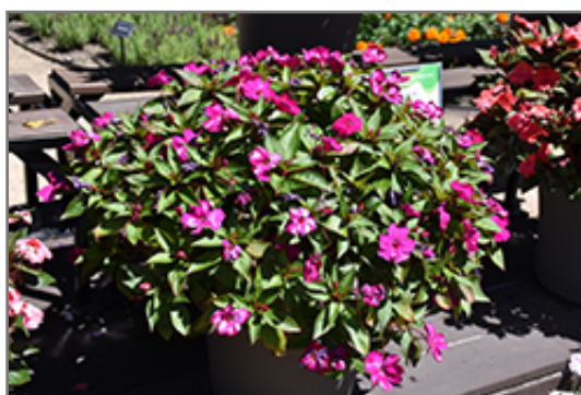
Solarscape Neon Purple Impatiens in bloom