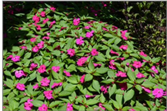
Solarscape Neon Purple Impatiens in bloom

Solarscape Neon Purple Impatiens will grow to be about 9 inches tall at maturity, with a spread of 20 inches. When grown in masses or used as a bedding plant, individual plants should be spaced approximately 14 inches apart. Its foliage tends to remain low and dense right to the ground. This fast-growing annual will normally live for one full growing season, needing replacement the following year.