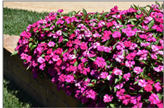
Solarscape Magenta Bliss Impatiens in bloom

Solarscape Magenta Bliss Impatiens is recommended for the following landscape applications;