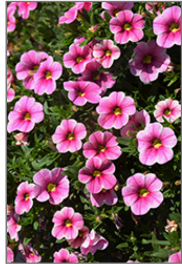
Cabaret Strawberry Parfait Calibrachoa flowers

Cabaret Strawberry Parfait Calibrachoa is a fine choice for the garden, but it is also a good selection for planting in outdoor containers and hanging baskets. Because of its trailing habit of growth, it is ideally suited for use as a 'spiller' in the 'spiller-thriller-filler' container combination; plant it near the edges where it can spill gracefully over the pot. Note that when growing plants in outdoor containers and baskets, they may require more frequent waterings than they would in the yard or garden.