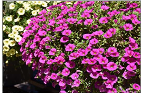
Cabaret Pink Calibrachoa flowers

Cabaret Pink Calibrachoa is recommended for the following landscape applications;