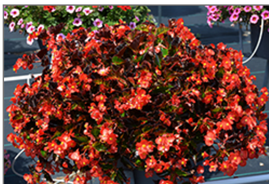
Hula Red Begonia in bloom