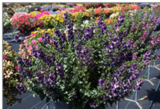
AngelDance Violet Bicolor Angelonia in bloom