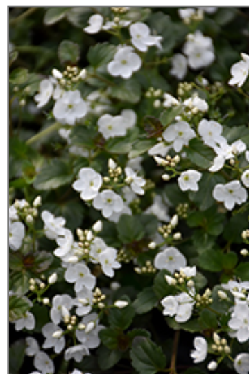
Whitewater Speedwell flowers

Whitewater Speedwell is recommended for the following landscape applications;