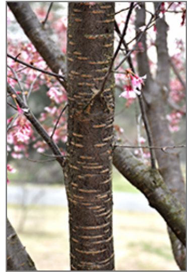
Autumnalis Higan Cherry bark

This plant is not reliably hardy in our region, and certain restrictions may apply; contact the store for more information.