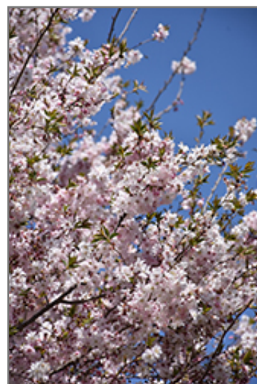
Autumnalis Higan Cherry flowers