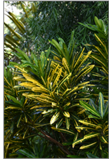
Sunny Star Variegated Croton foliage

This plant does best in full sun to partial shade. It does best in average to evenly moist conditions, but will not tolerate standing water. This plant is a heavy feeder that requires frequent fertilizing throughout the growing season to perform at its best. It is not particular as to soil pH, but grows best in rich soils. It is somewhat tolerant of urban pollution. This is a selected variety of a species not originally from North America, and parts of it are known to be toxic to humans and animals, so care should be exercised in planting it around children and pets.