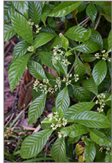
Florida Wild Coffee flowers

Florida Wild Coffee will grow to be about 10 feet tall at maturity, with a spread of 8 feet. Although it is technically a woody plant, this plant can be expected to behave as a perennial in our climate if planted outdoors over the winter, usually regrowing from its base (crown) the following year. As such, gardeners should take into consideration that it will perform differently than it would in its native habitat. This is a self-pollinating variety, so it doesn't require a second plant nearby to set fruit.