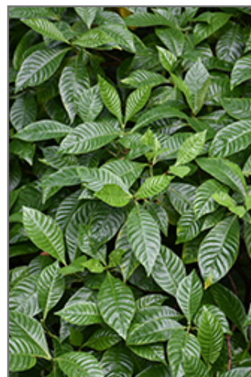
Florida Wild Coffee foliage

This plant will require occasional maintenance and upkeep, and can be pruned at anytime. It is a good choice for attracting birds, bees and butterflies to your yard. It has no significant negative characteristics.