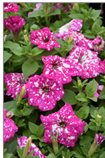
Headliner Light Pink Sky Petunia flowers

Headliner Light Pink Sky Petunia is recommended for the following landscape applications;