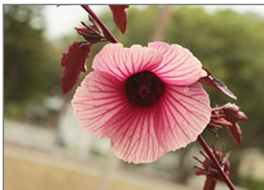
Cranberry Hibiscus flowers

Cranberry Hibiscus is recommended for the following landscape applications;