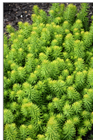
Prima Angelina Stonecrop