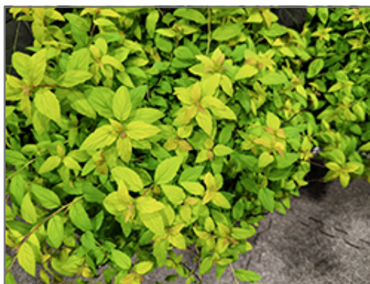
Little Spark Spirea foliage