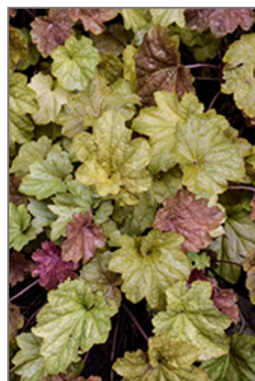
Big Top Caramel Apple Coral Bells foliage