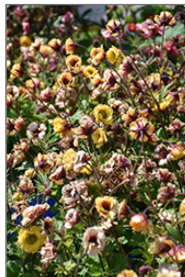
Tempo Yellow Avens flowers

Tempo Yellow Avens is recommended for the following landscape applications;