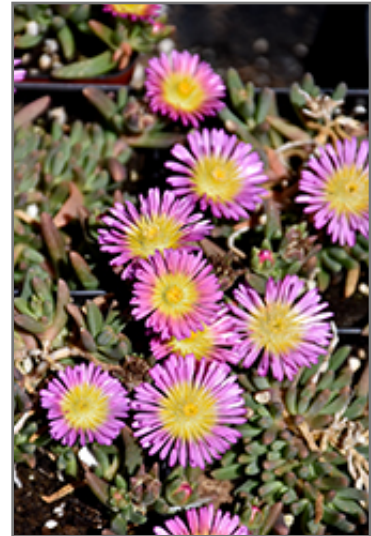
Delmara Pink Halo Ice Plant flowers

Delmara Pink Halo Ice Plant is recommended for the following landscape applications;