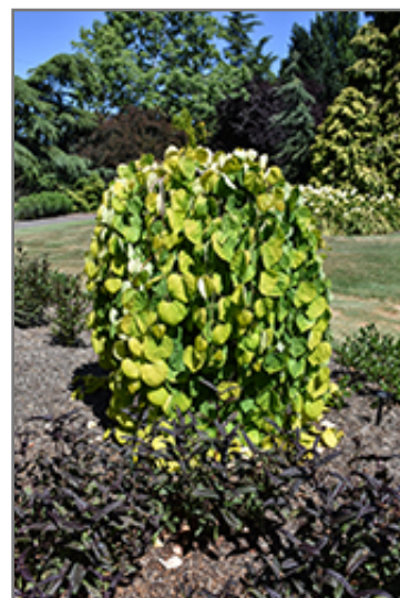
Golden Falls Redbud

Golden Falls Redbud is recommended for the following landscape applications;