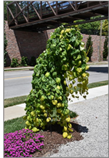
Golden Falls Redbud

This plant is not reliably hardy in our region, and certain restrictions may apply; contact the store for more information.