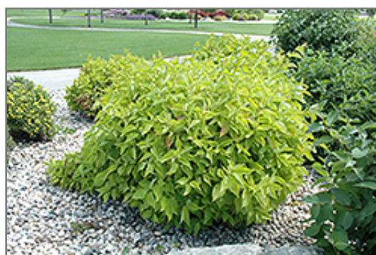
Prairie Fire Dogwood