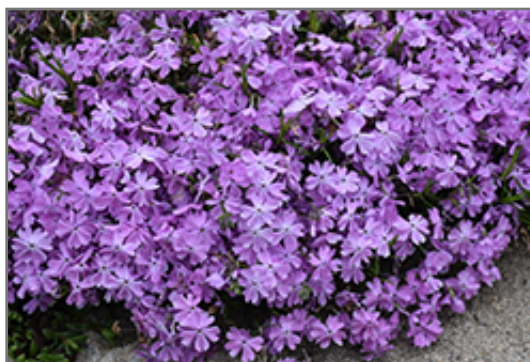
Spring Bling Pink Sparkles Creeping Phlox flowers

Spring Bling Pink Sparkles Creeping Phlox is recommended for the following landscape applications;