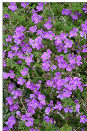
La Veta Lace Cranesbill flowers

La Veta Lace Cranesbill is recommended for the following landscape applications;