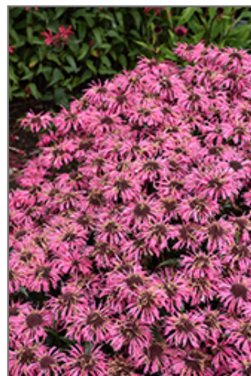
Upscale Pink Chenille Beebalm flowers

Upscale Pink Chenille Beebalm is an herbaceous perennial with a mounded form. Its medium texture blends into the garden, but can always be balanced by a couple of finer or coarser plants for an effective composition.