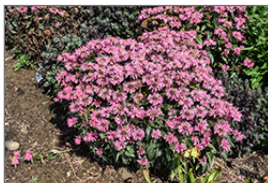
Upscale Pink Chenille Beebalm in bloom