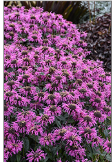
Upscale Lavender Taffeta Beebalm flowers