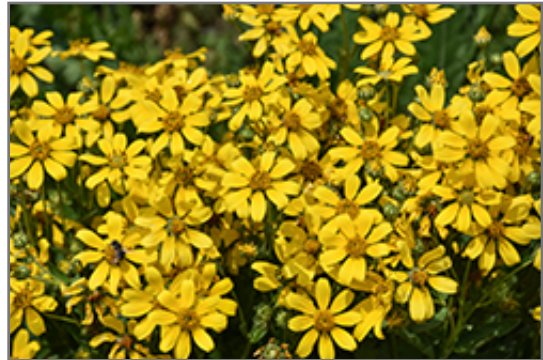
Engelmann's Daisy flowers

Engelmann's Daisy will grow to be about 24 inches tall at maturity, with a spread of 18 inches. It grows at a fast rate, and under ideal conditions can be expected to live for approximately 5 years. As an herbaceous perennial, this plant will usually die back to the crown each winter, and will regrow from the base each spring. Be careful not to disturb the crown in late winter when it may not be readily seen!