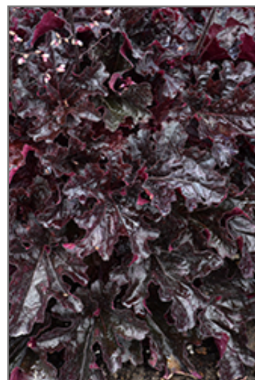
Dressed Up Evening Gown Coral Bells foliage

Dressed Up Evening Gown Coral Bells is recommended for the following landscape applications;