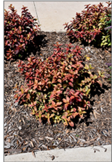
Midnight Sun Reblooming Weigela

This plant is not reliably hardy in our region, and certain restrictions may apply; contact the store for more information.