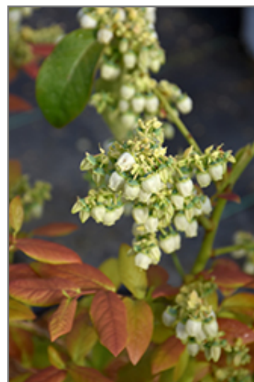
Sky Dew Gold Ornamental Blueberry flowers