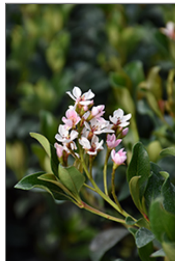
La Vida Mas Indian Hawthorn flowers