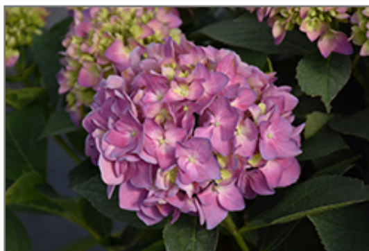
Let's Dance Sky View Hydrangea flowers