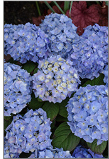
Let's Dance Sky View Hydrangea flowers

This plant is not reliably hardy in our region, and certain restrictions may apply; contact the store for more information.