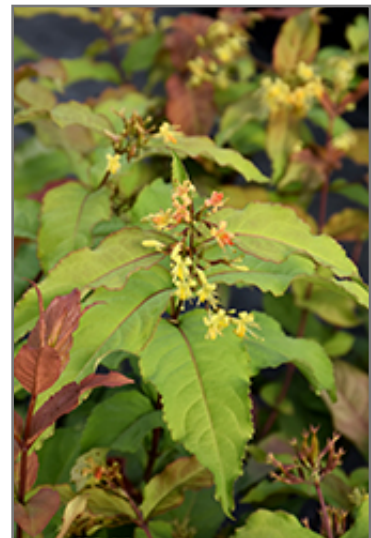
Kodiak Fresh Diervilla flowers