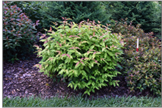
Kodiak Fresh Diervilla