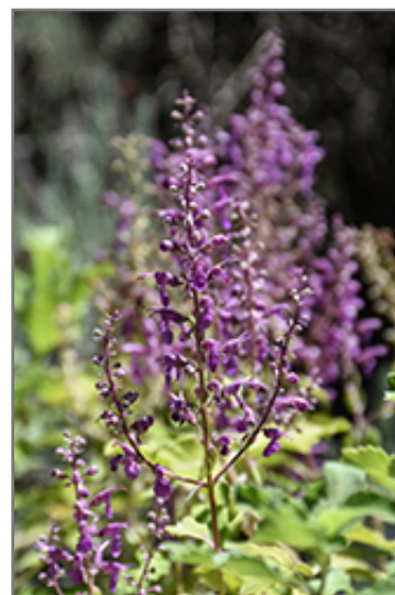
Madeira Germander flowers

Madeira Germander is recommended for the following landscape applications;