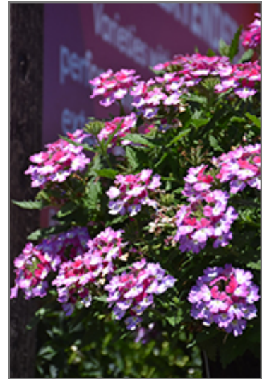
Beats Purple+White Verbena flowers

Beats Purple+White Verbena is recommended for the following landscape applications;