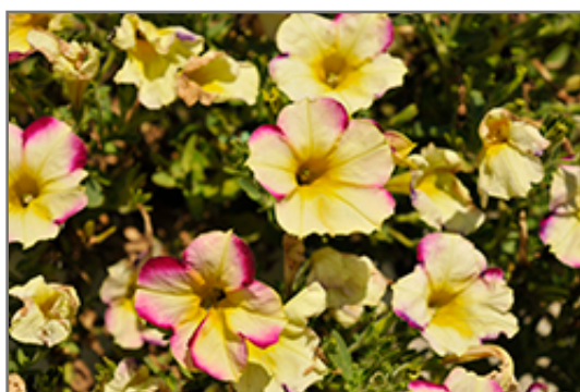
Headliner Banana Cherry Petunia flowers