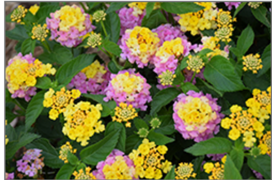
Havana Sunrise Lantana flowers

Havana Sunrise Lantana is recommended for the following landscape applications;