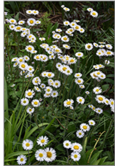
Philidelphia Fleabane flowers

Philidelphia Fleabane will grow to be about 12 inches tall at maturity extending to 30 inches tall with the flowers, with a spread of 24 inches. It grows at a fast rate, and under ideal conditions can be expected to live for approximately 3 years. As an herbaceous perennial, this plant will usually die back to the crown each winter, and will regrow from the base each spring. Be careful not to disturb the crown in late winter when it may not be readily seen!