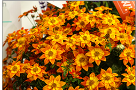
Bidy Boom Wildfire Bidens flowers