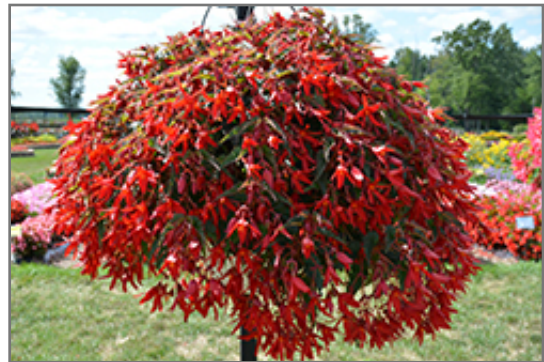
Beauvilia Red Begonia in bloom

Beauvilia Red Begonia is recommended for the following landscape applications;