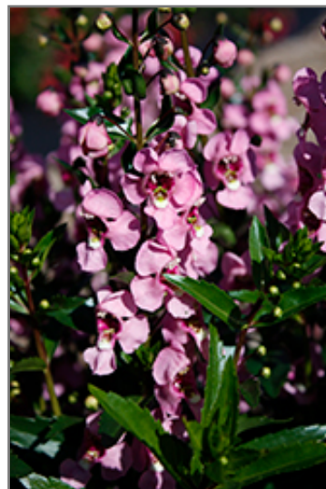
Aria Alta Pink Angelonia flowers

Aria Alta Pink Angelonia is recommended for the following landscape applications;