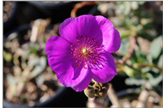
Jazz Time Rock Purslane flowers

Jazz Time Rock Purslane is a fine choice for the garden, but it is also a good selection for planting in outdoor containers and hanging baskets. With its upright habit of growth, it is best suited for use as a 'thriller' in the 'spiller-thriller-filler' container combination; plant it near the center of the pot, surrounded by smaller plants and those that spill over the edges. Note that when growing plants in outdoor containers and baskets, they may require more frequent waterings than they would in the yard or garden.