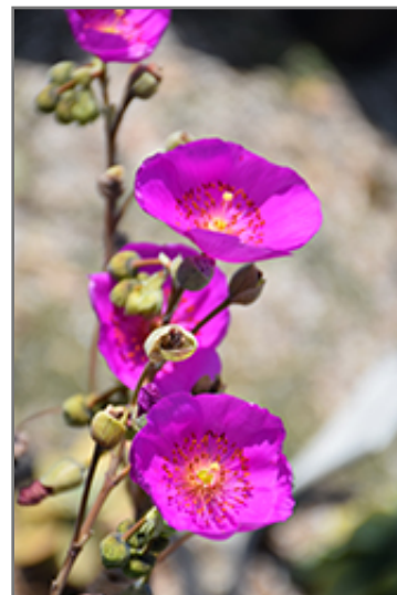
Jazz Time Rock Purslane flowers

Jazz Time Rock Purslane is recommended for the following landscape applications;